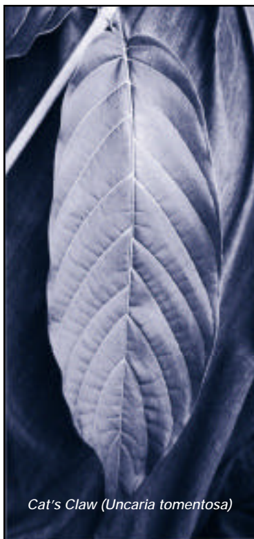
Cat's Claw (Uncaria tomentosa)