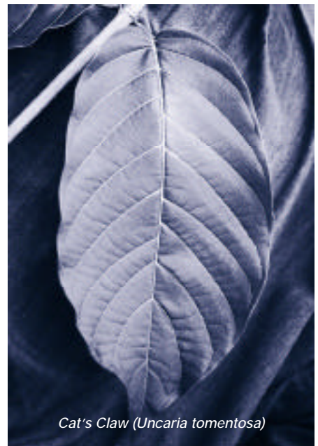
Cat's Claw ( Uncaria tomentosa )